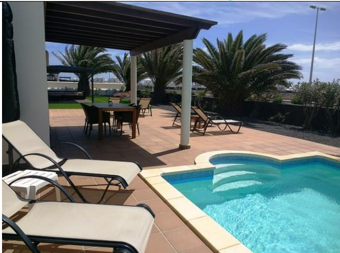
Comfortable Sunbeds and Seating besides pool