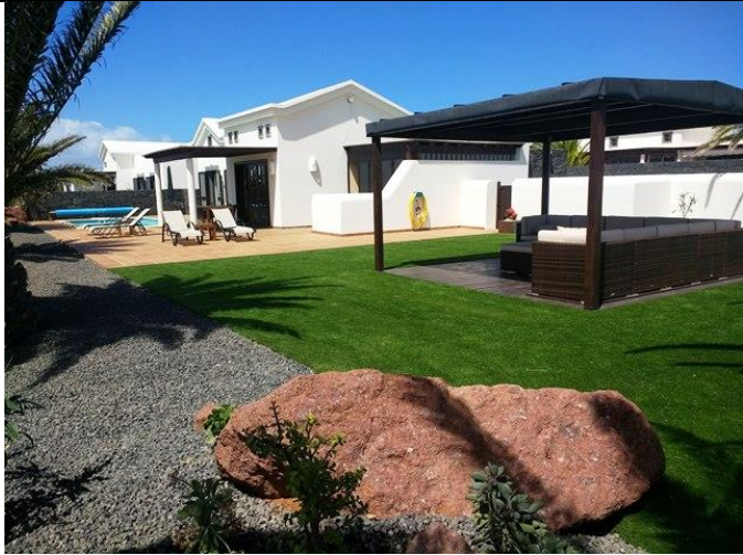
Astroturf area to side of Garden