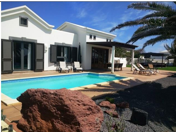
View from the edge of the Garden