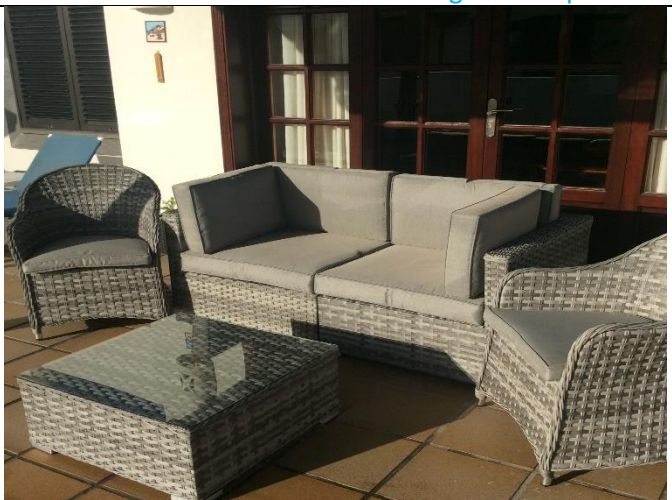
Rattan Furniture outside Lounge