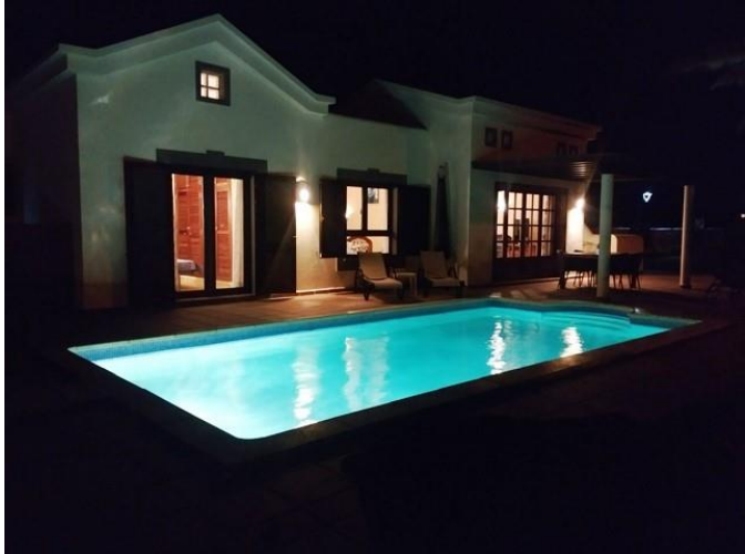
View of the Villa at Night