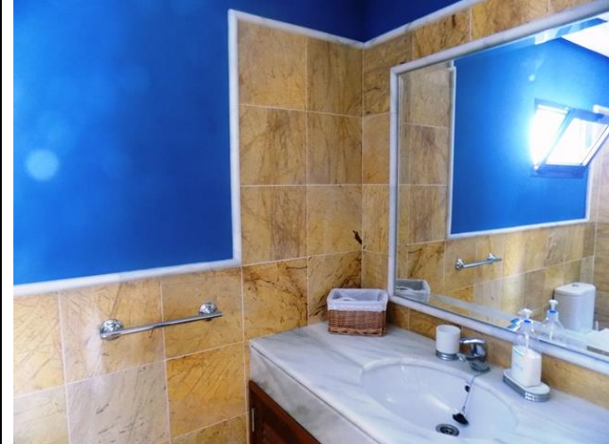
One of two bath/shower rooms

The Terrace/Pool Area has ample space for sunbathing on comfortable sunbeds besides the private electrically heated pool (8m x 4m) which is set to heat to 28 degrees.