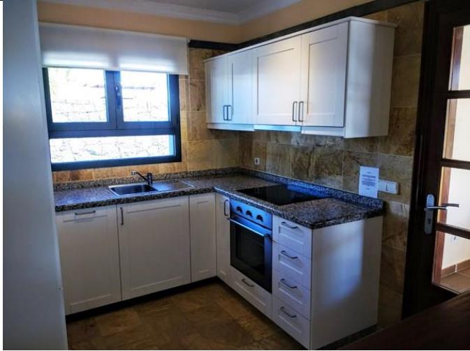
Fully Fitted Kitchen