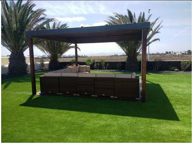
Central Chillout Area – Sea Views

Atlantic View is situated at the base of Montana Roja on La Goleta, phase 6 of the wider Faro Park development. The thing that sets this villa apart from most others is the spacious Astroturf area with chillout lounge looking out to sea.