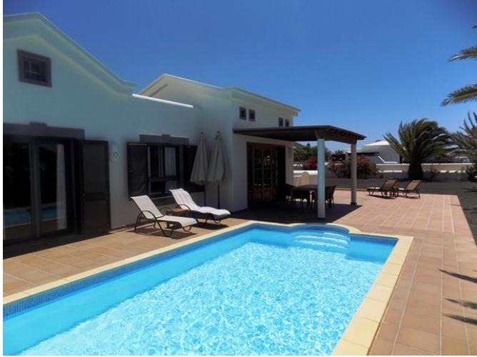
Pool / Terrace Area

Atlantic View : 2 Bedroom Detached Villa with excellent outside space and sea views