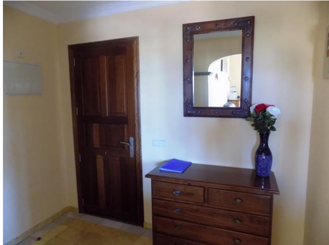
Entrance to the Villa

2 Bedrooms (1 Double and 1 Twin), the villa can accommodate family groups of up to 4 (or 5 with a Z-bed or Cot added for a young child / infant). Larger groups can be accommodated in other nearby villas as we have several in this location – Ask John for details.