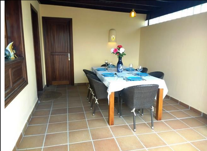
Al-Fresco Dining area to the side of the Villa

Entertainment comes in the form of Full UK and Sky/BT/Bein Package ; Movies/Films and catchup.