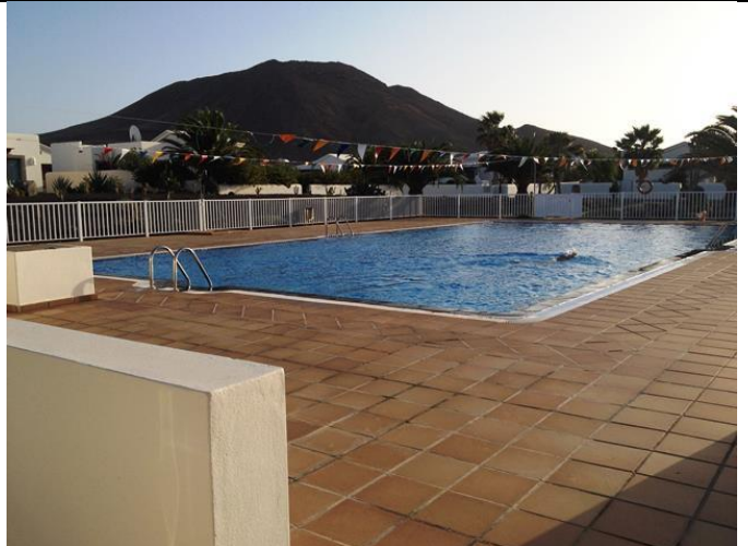
Large Communal Pool located on La Goleta