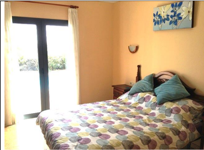
Master Bedroom (En Suite)